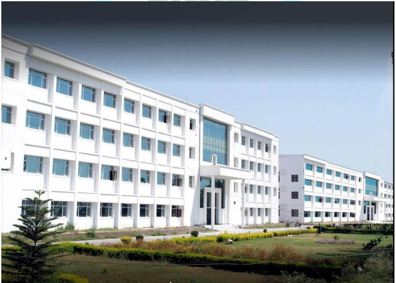
Himachal Institute of Dental Sciences, Paonta Sahib, Himachal Pradesh