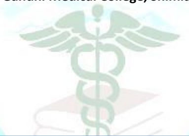
A VIEW Indra Gandhi Medical College, Shimla