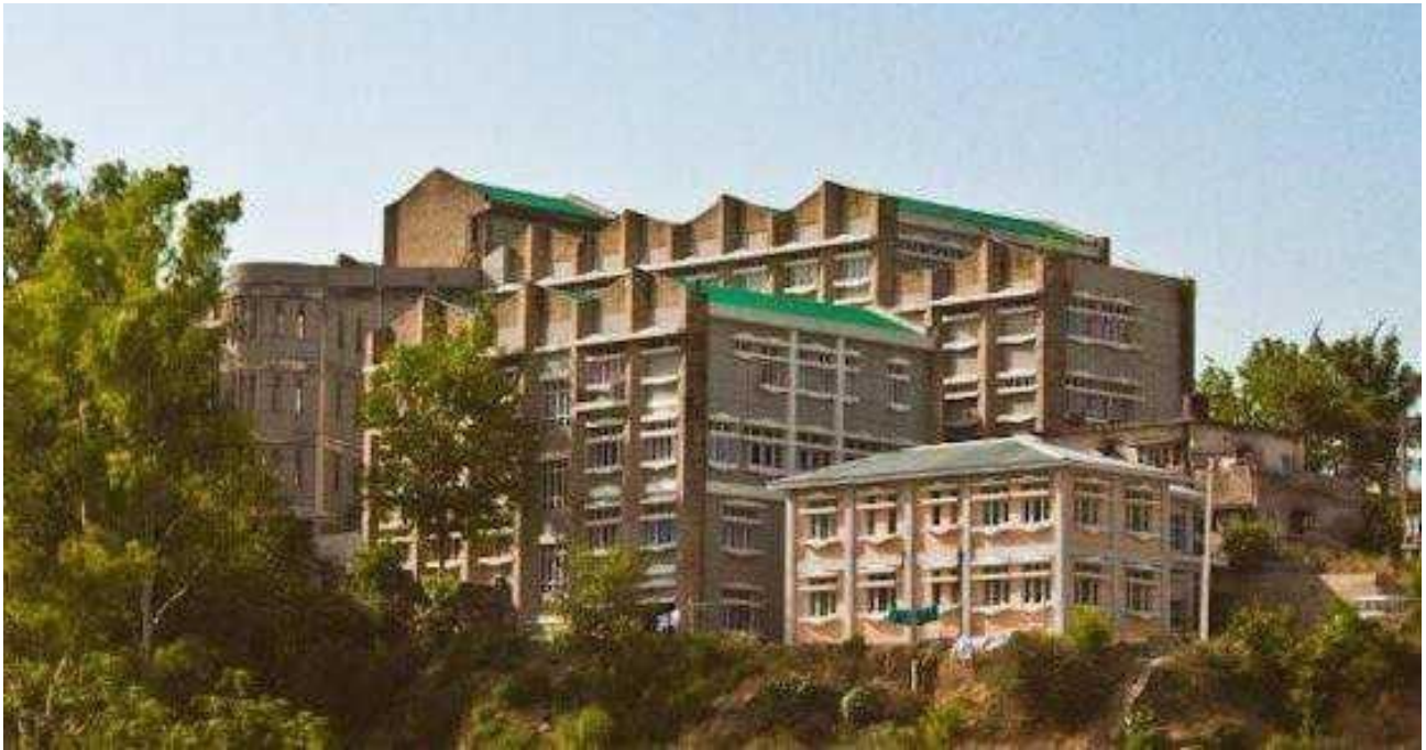
Dr. Radha Krishnan Govt. Medical College, Hamirpur