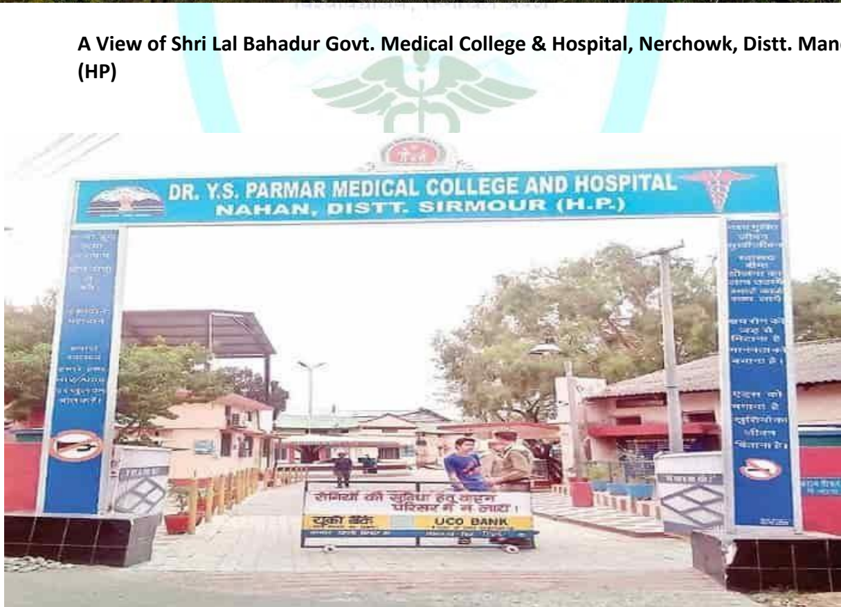
Dr. Y. P. Parmar Govt. Medical College, Nahan