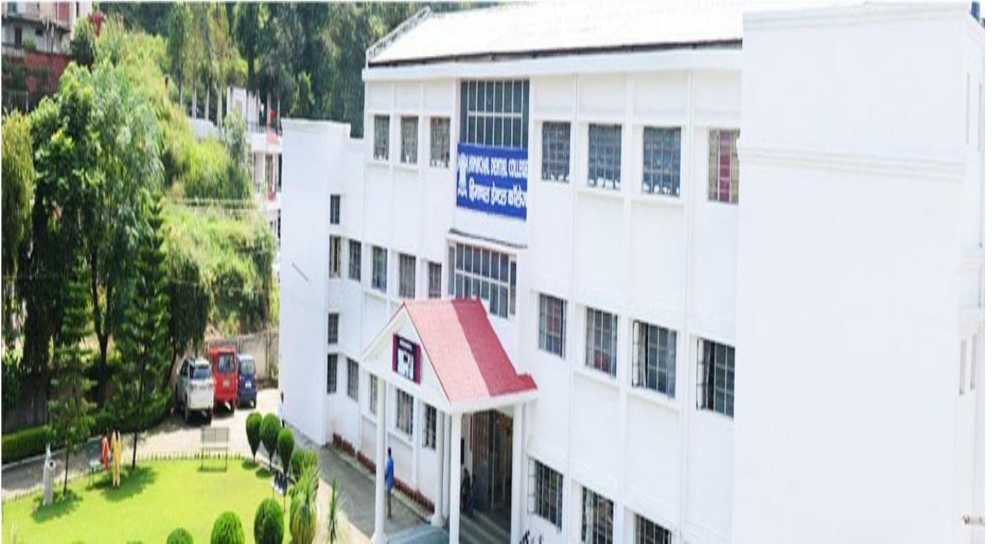
Himachal Dental College, Sunder Nagar, HP