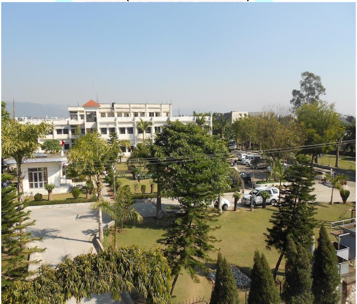
Bhojia Dental College and Hospital Chandigarh - Nalagarh Road, Budh (Baddi), Teh. Baddi, Distt. Solan, Himachal Pradesh