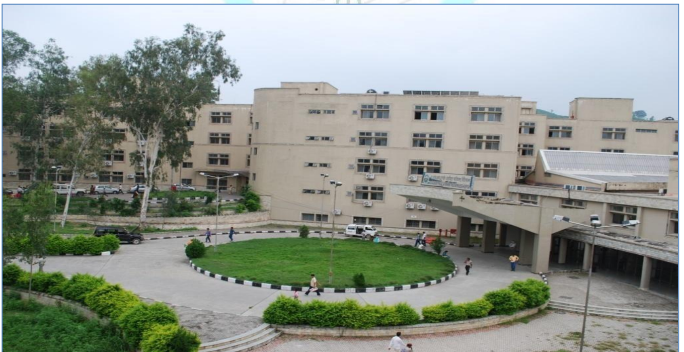
A VIEW OF Dr. R.P.G.M.C, TANDA AT KANGRA (H.P.)