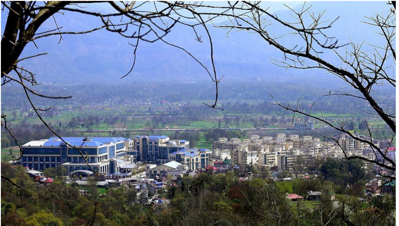
A View of Shri Lal Bahadur Govt. Medical College & Hospital, Nerchowk, Distt. Mandi (HP)