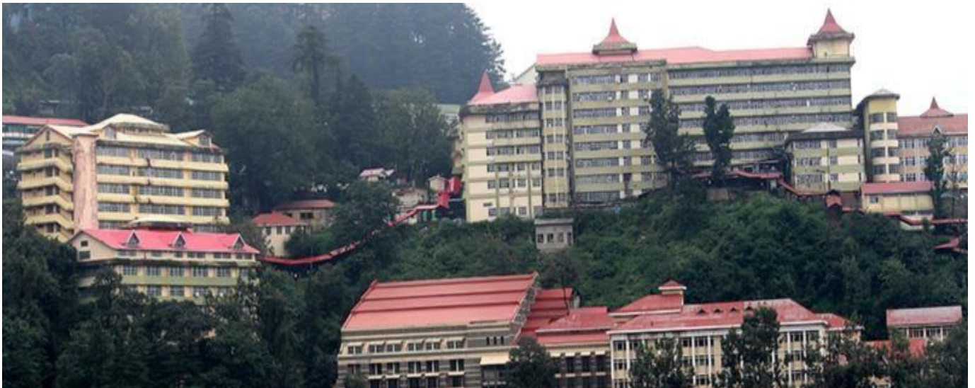
H.P. GOVERNMENT DENTAL COLLEGE & HOSPITAL SHIMLA (HIMACHAL PRADESH)