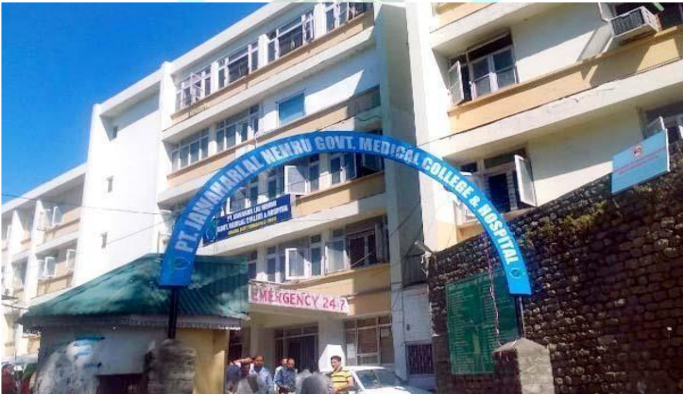
Jawahar Lal Nehru Govt. Medical College, Chamba