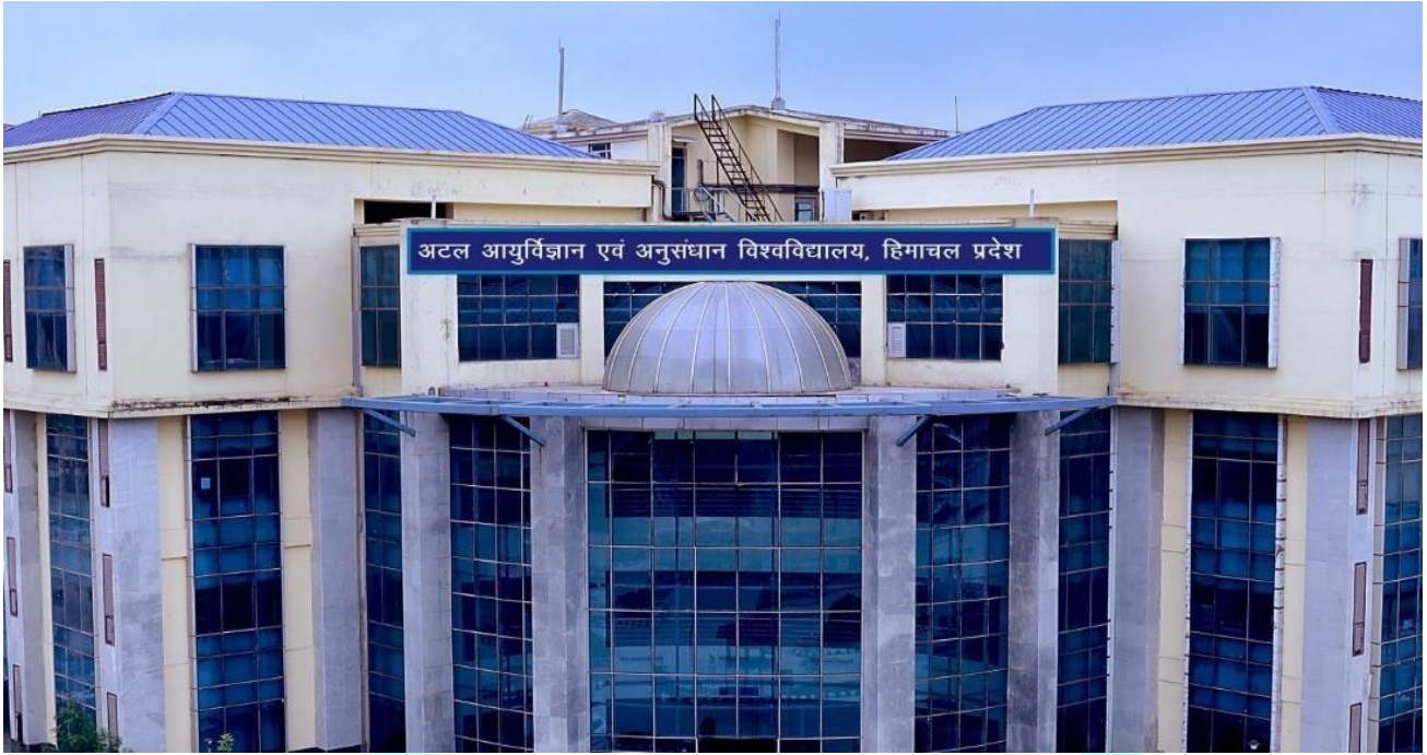
A VIEW Atal Medical and Research University, HP at Ner Chowk, Distt. Mandi