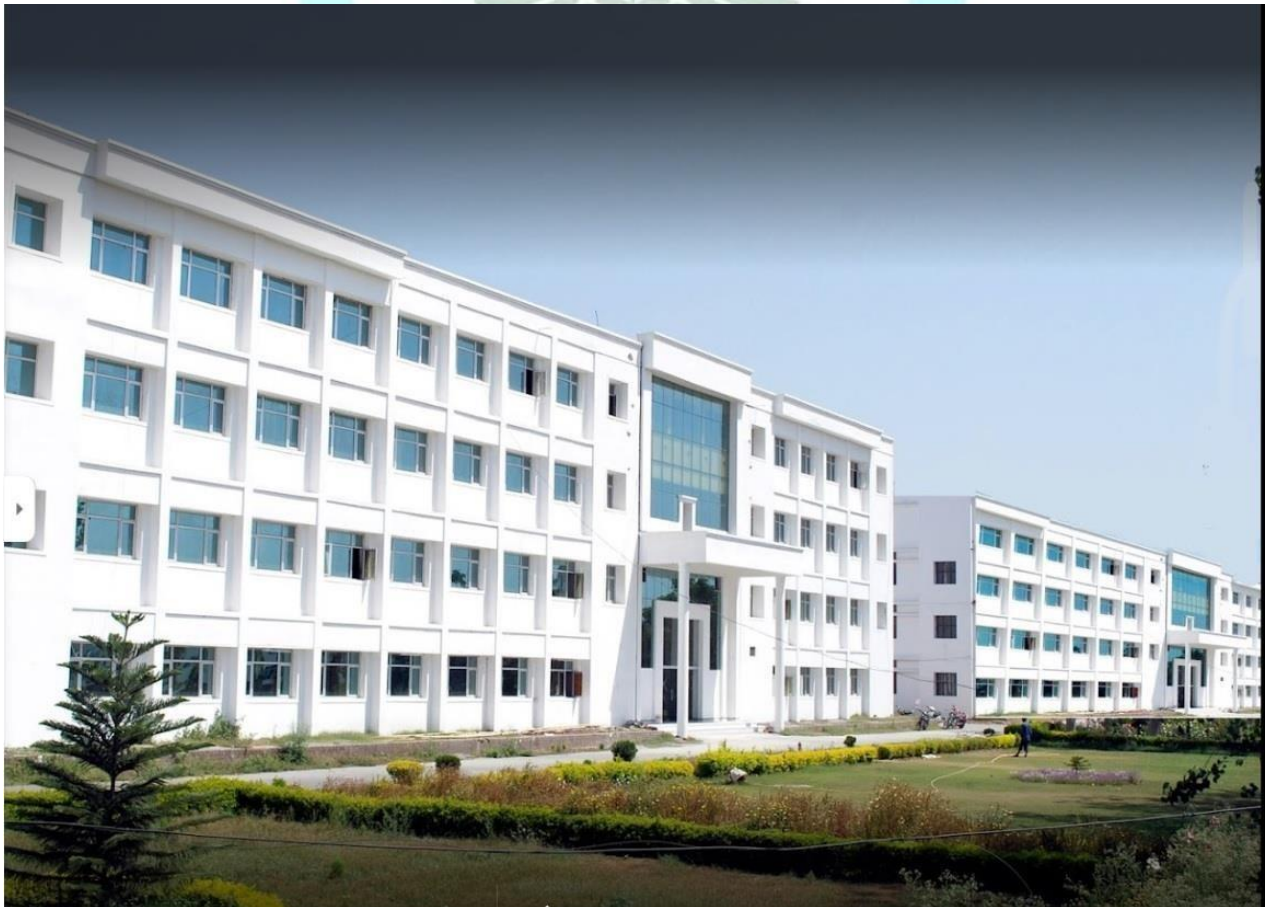
Himachal Institute of Dental Sciences, Paonta Sahib, Himachal Pradesh