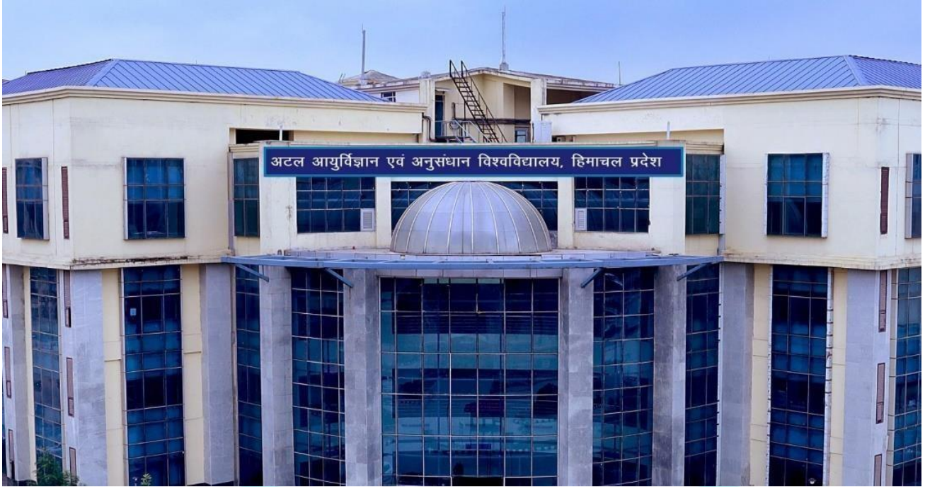
A VIEW Atal Medical and Research University, HP at Ner Chowk, Distt. Mandi