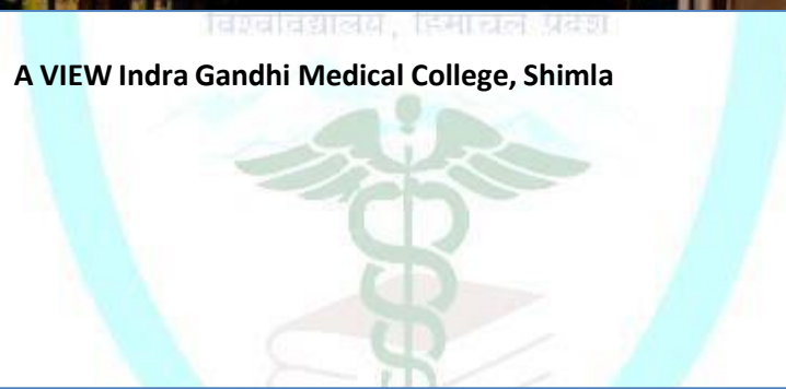
A VIEW Indra Gandhi Medical College, Shimla