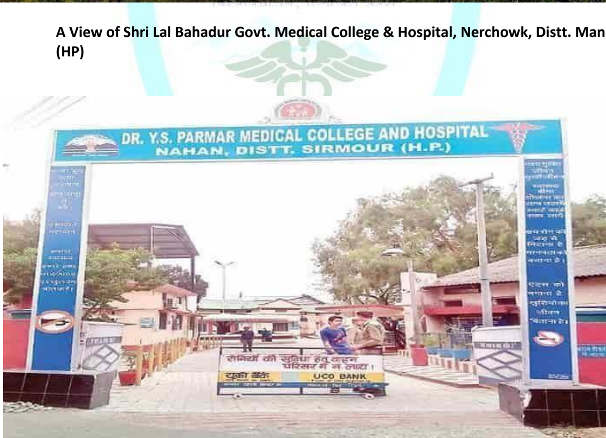
Dr. Y. P. Parmar Govt. Medical College, Nahan