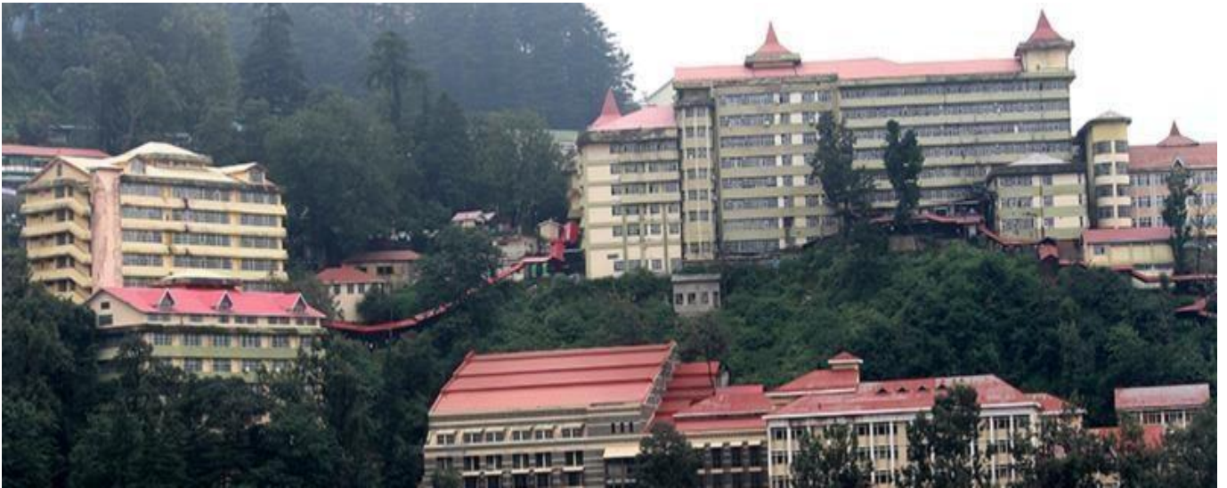
H.P. GOVERNMENT DENTAL COLLEGE & HOSPITAL SHIMLA (HIMACHAL PRADESH)