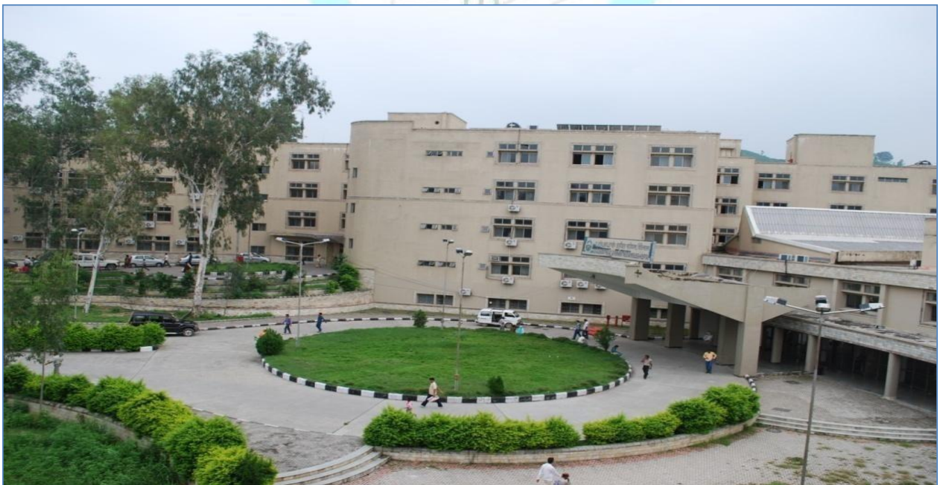
A VIEW OF Dr. R.P.G.M.C, TANDA AT KANGRA (H.P.)