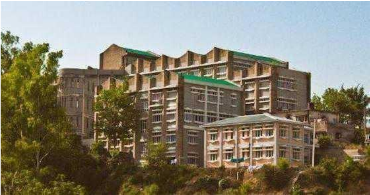
Dr. Radha Krishnan Govt. Medical College, Hamirpur